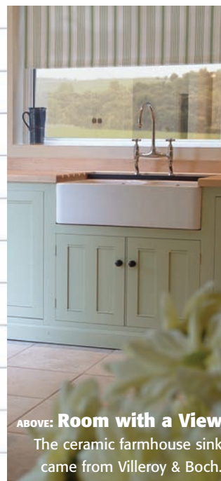
ABOVE: Room with a View

Words Debbie Jeffrey