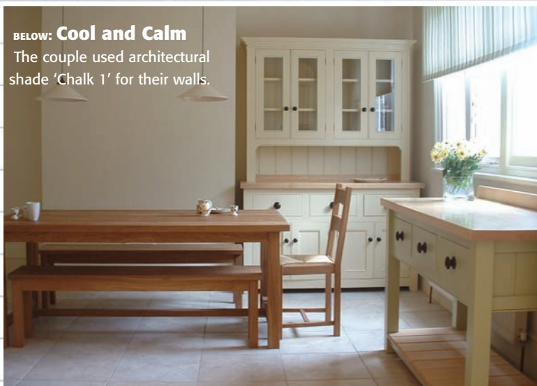
BELOW: Cool and Calm