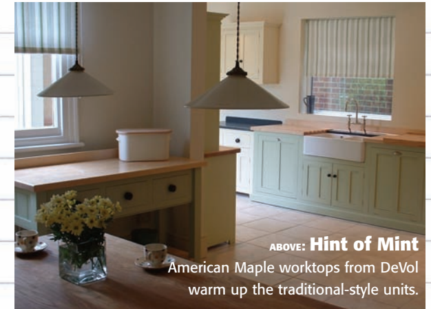
ABOVE: Hint of Mint

American Maple worktops from DeVol warm up the traditional-style units.